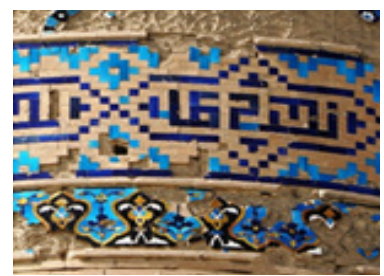
Picture 8: Kufic Calligraph, the Margin of Arabesque Pattern, Mosaic Tile, Southeast Minaret

The decorations in the northeast minaret of the school are destroyed more than in the southwest and northwest minarets. Of the decorations there, only the Kufic inscription remains undamaged. Also, a margin, which is a combination of leaves, petals, crowns, half-crowns, and almonds, is designed around the northeast minaret of the school under the Kufic inscription. It should be noted that many parts of this margin have been damaged and disappeared, and a small part of itis also found in the form of collapsed and scattered on the northeast side of the minaret (Picture 8).