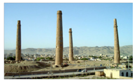
Picture 1: View of the Four Minarets of Sultan Hussein Mirza School, North of the Old City of Herat, Afghanistan

Park on Khiaban Street and Injil Stream (Picture 1). The minarets of this school have very beautiful and high-quality tiles and motifs that amaze the viewers (Rajaei, 1347: 41).