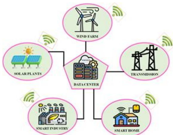
Figure 3.1 IoT Based Smart Grid Monitoring System

storage purposes. A real-time control is facilitated by the IoT connectivity and these distributed energy resources are monitored which in turn makes the system adapt to varying requirements of energy and environmental conditions. The parameters like output power, current and voltage of PV and wind generation systems are monitored continuously. This enables tracking of energy harvesting performance and detection of any degradation or anomalies in renewable energy sources. The basic representation of an IoT based smart grid monitoring system is shown in Figure 3.1.